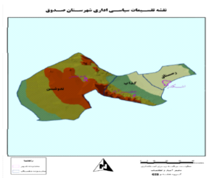
Figure 1 – Hamlets of Saduq County